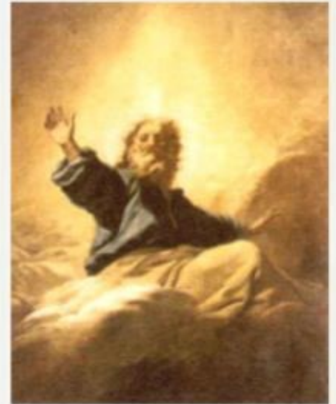
The Eternal Father Attributed to the Workshop of Jean Jouvenet Before 1741 Collection of The Grey Nuns of Montreal 1974.A.100

October 19: After breakfast, we board our bus and make our way to the Basilica of Holy Hill, the National Shrine of Mary, Help of Christians, a registered national landmark that attracts more than 500,000 visitors annually. The site, located on 435 acres of rural countryside at the highest elevation (1,300 feet) in the southeastern part of Wisconsin, features the stunning architecture of the neo-Romanesque church built in 1926 and fully renovated in 2005. Its 435 acres of rural countryside offers visitors peace, serenity, and beauty. Features include an outdoor Stations of the Cross, a scenic tower offering a breathtaking view of the surrounding Kettle Moraine area, and the Old Monastery Inn Cafeteria known for its excellent desserts. Run by Discalced